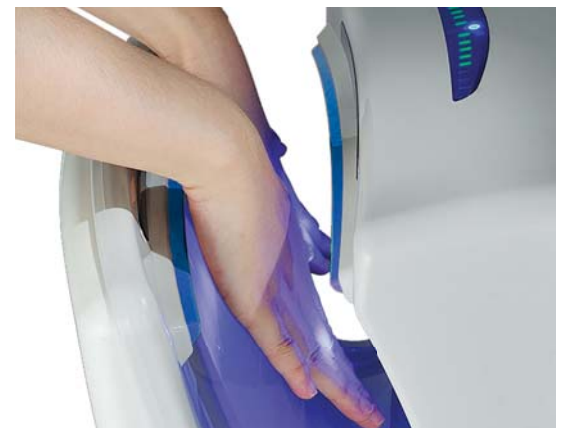
WHITE | BB702W