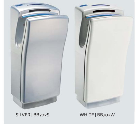
SILVER | BB702S