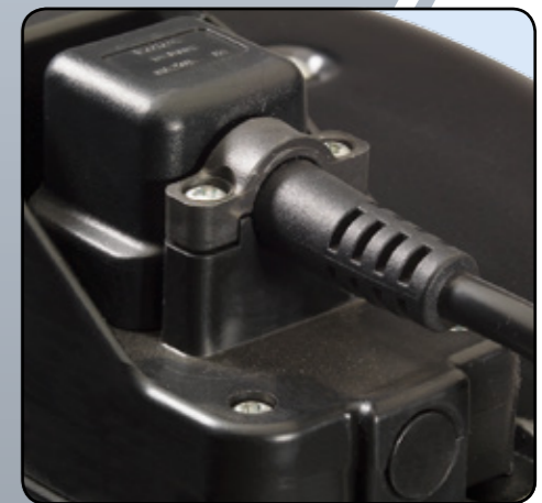
Nucable easy replacement plugged cable system