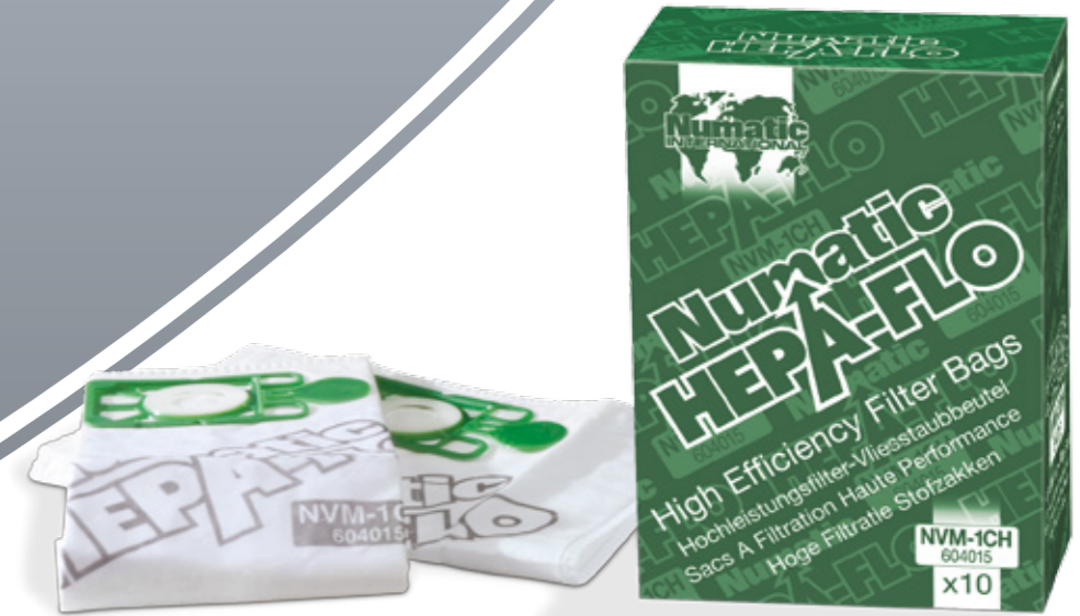
HepaFlo bags, clean to use and easy to empty