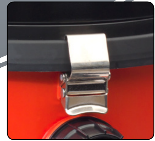
Professional specification throughout