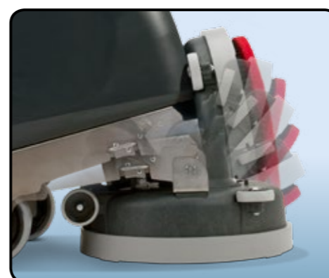
Tilting deck for easy brush change and storage