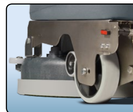
Full stainless steel chassis and non marking wheels