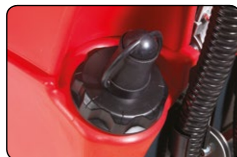
Flexifill 1m easy fill hose