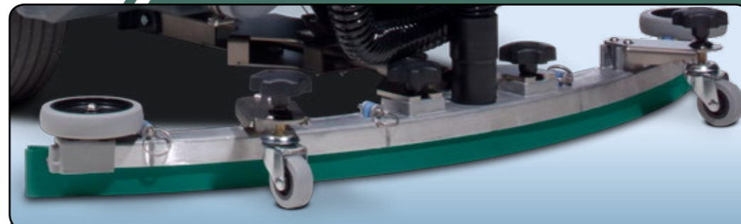
TRO Aluminium / Polyurethane floor tool