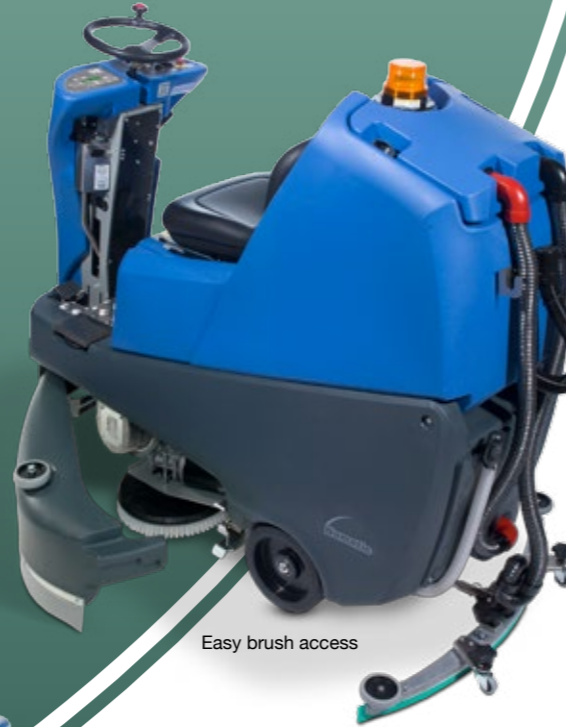
Easy brush access

The TRO650 is blessed with a commanding operator driving position, front wheel traction drive, a magnificent turning circle and one pass performance that really will ensure you get the standard you want, exactly when you want it... and fast.