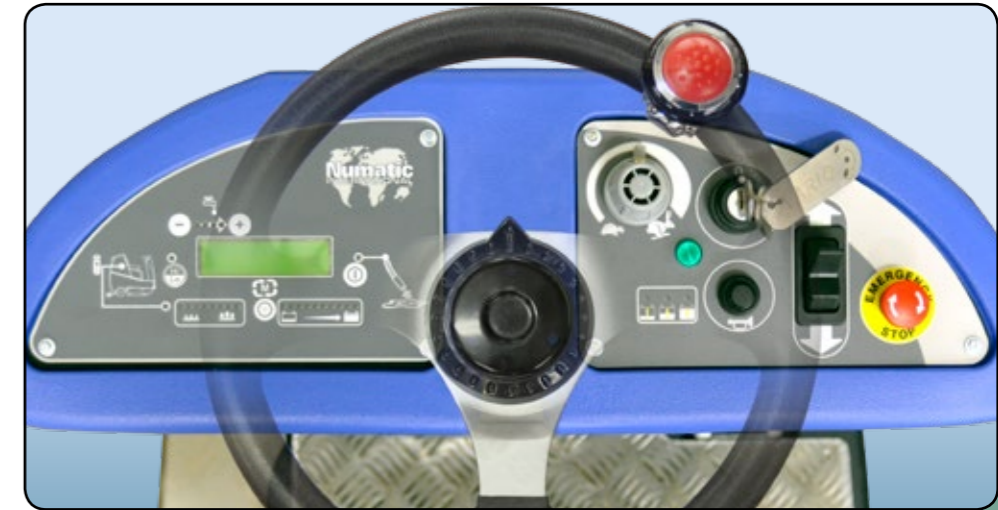
Full control dashboard