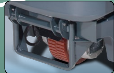
Drive wheel protector

A full 120 litre capacity with a fixed 650mm twin brush power head the TRO650 is ready to go.