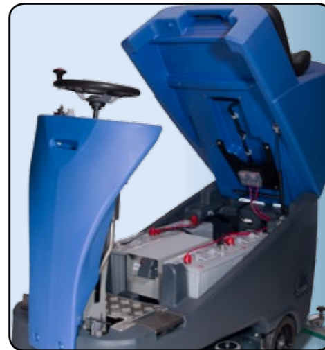
Easy maintenance access

A full 120 litre capacity with a fixed 650mm twin brush power head the TRO650 is ready to go.