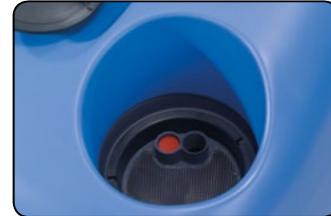
Easy and generous fill cap