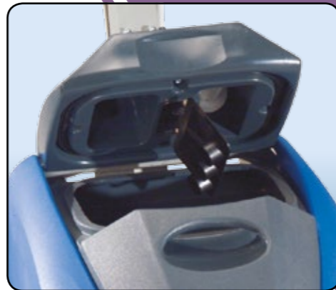
Overfill cut off system