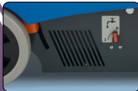
Adjustable water flow