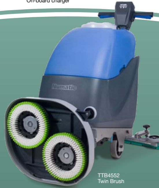
TTB4552 Twin Brush