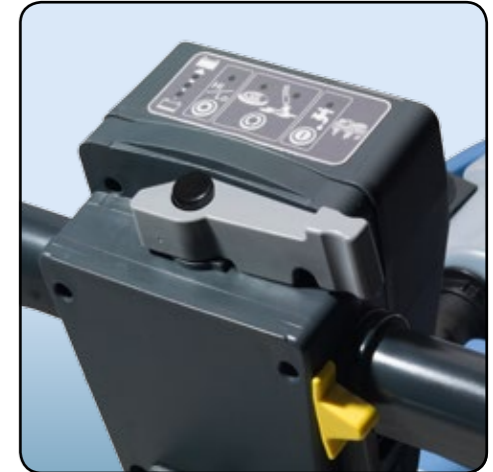
Soft touch Nutronic controls