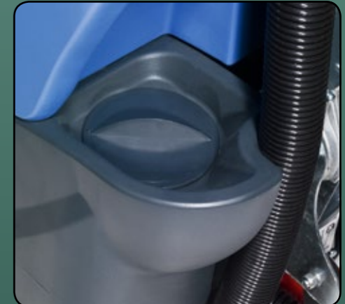
Additional fill and filter point