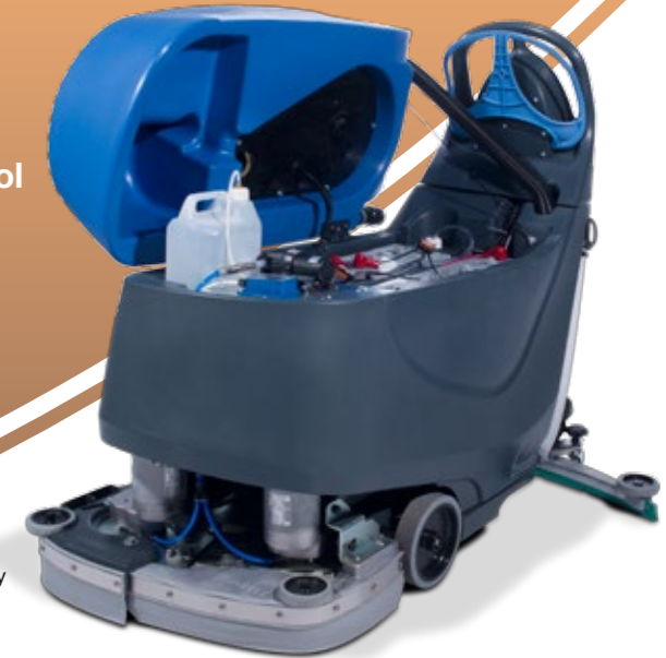
Easy battery access

Beneath the hinged dirty water tank sits the operating heart of the Vario with its 200Ahr gel battery and charging system, high performance suction unit and NuChem dosing facility... all easily accessible.