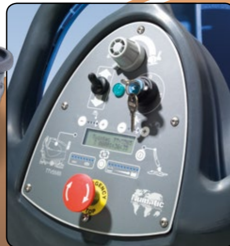
Simple to use Nutronic control panel

The operator controls are a separate feature in their own right with independent selection of speed, water flow and chemical dosing all built in to the basic unit, all of which can be set to provide total convenience and consistency of operation.