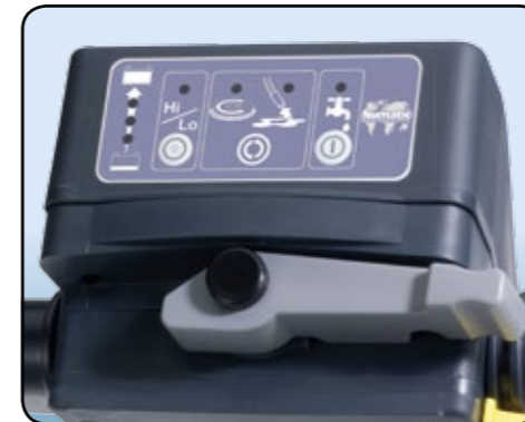
Simple soft touch controls