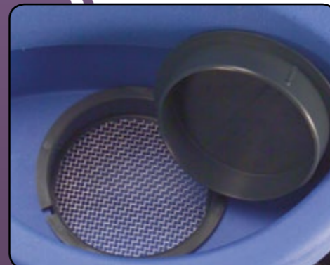
Easy tank filling access