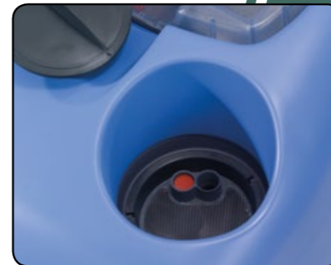
Easy and generous fill cap