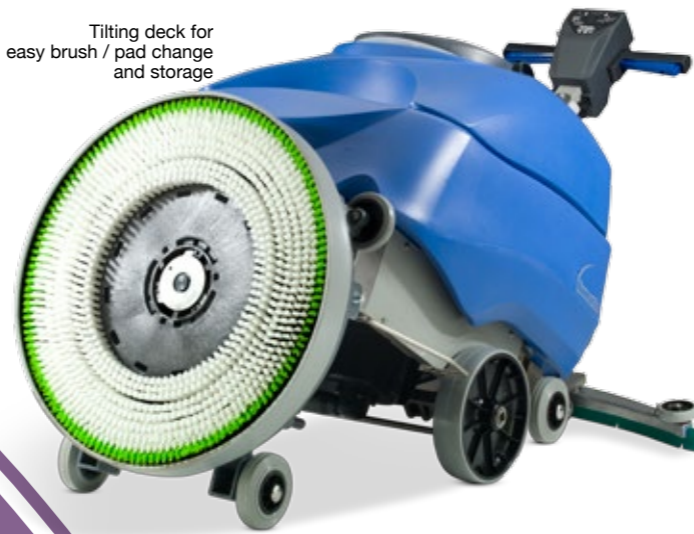
Tilting deck for easy brush / pad change and storage