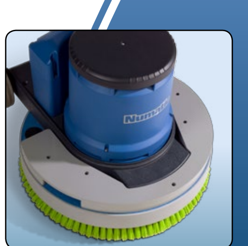
Optional 10Kg additional weight

available to cover wet applications, carpet shampooing, vacuum polishing and floor sanding.