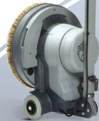
NR1500 folded for storage.