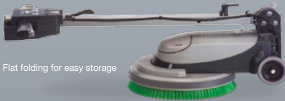
Flat folding for easy storage