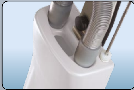
Solution tank option

A full range of 33cm (13") brushes and pad drives allows the machine to be used for all of the primary floorcare functions.