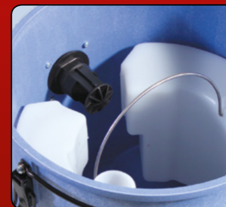
Tank within a tank