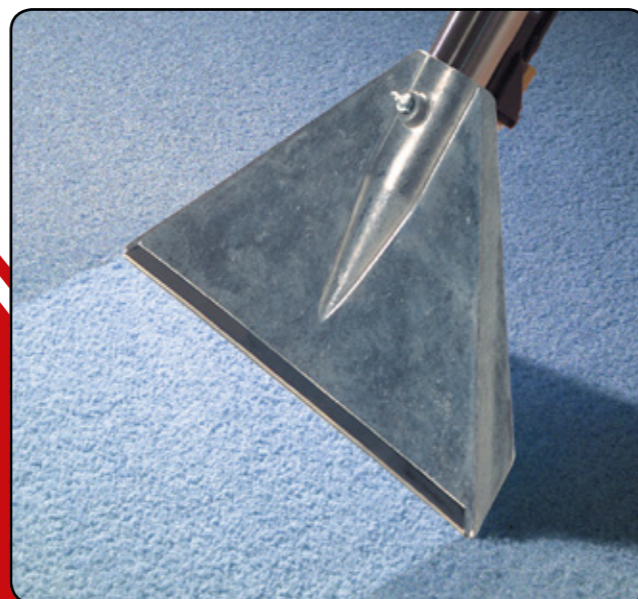
Fishtail aluminium injection / extraction system