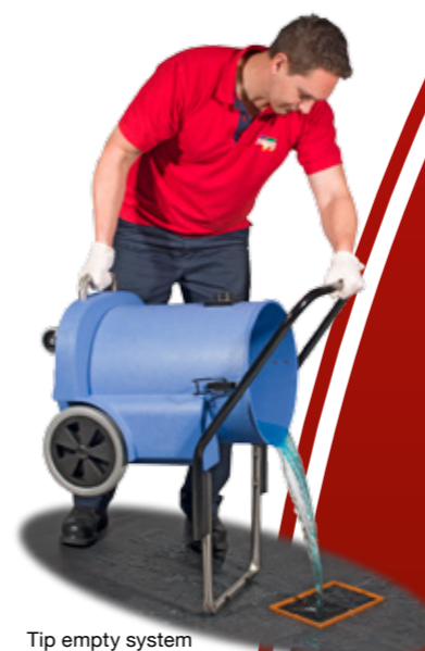
Tip empty system