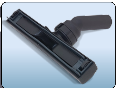
High efficiency ProFlo wet floor tool

For especially tough conditions the WV380 Structofoam drum design is ready for anything professional use will throw at it.