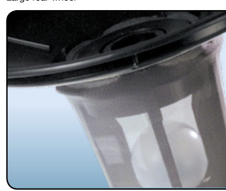
Safety net filter and float assembly