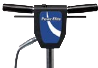
Safety lockout with steel activating levers