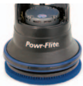
Non-conductive base & motor housings!