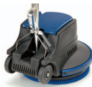
No exposed wires or capacitors!