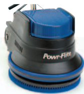
One piece base and motor housing!